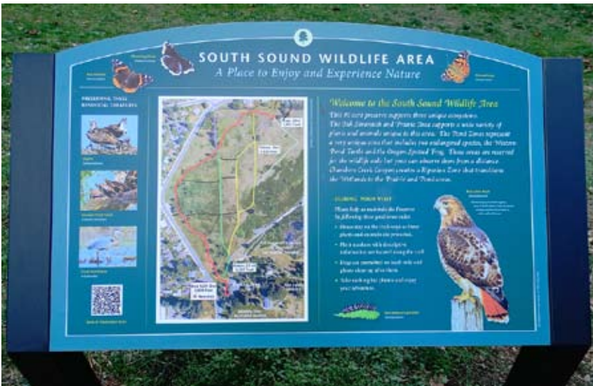
Recently installed kiosks provide information to visitors taking a self-guided tour.

That's assuming you know the place at all, of course—the Interpretive Center is a bit off the beaten path, lying