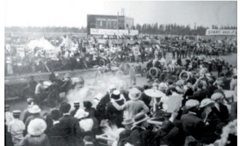
Even before the grandstand was built, enthusiastic crowds swarmed onto the grounds and right up to the edge of the track—unaware they were putting life and limb at risk...?

That’s where you’ll find our marker today—in the southeast corner of the campus, placed (fittingly enough) right by the automotive courses building complex.