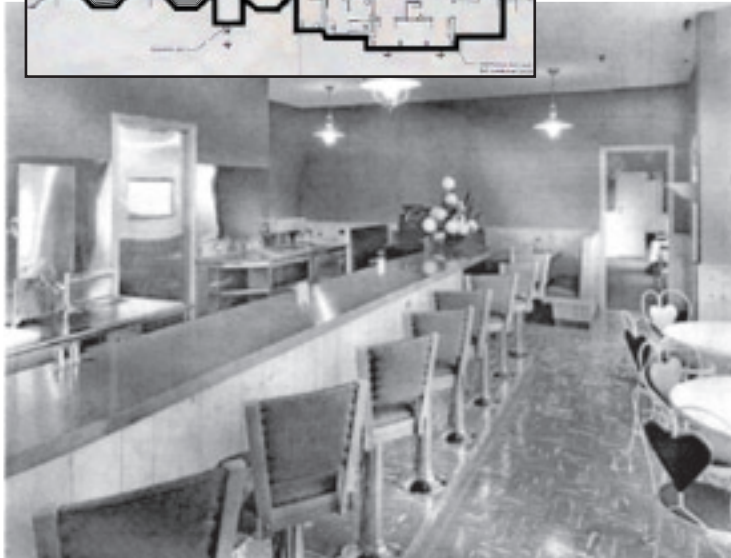
The Lakewood Terrace Snack Shop, newly remodeled in the latest style. Latest style of 1952, that is...