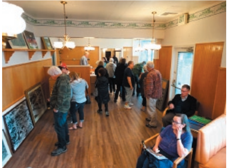
Sixty-seven years later: same bright and sunny space, put to a much different use. Opening day visitors, September 14, 2019.