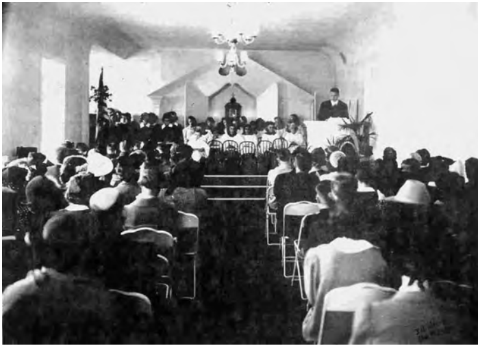
The sanctuary, 1939. Note folding chairs.

initial salary was $3,000 per year and $75 moving expense (the total operating budget was $4,500). During this time, the congregation witnessed a rapid increase in membership and a much-needed