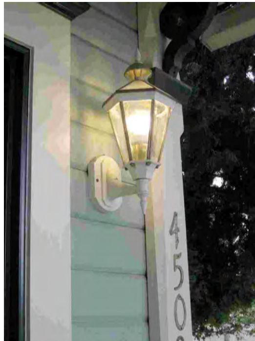
Typical Victorian architectural details. Cut glass in the front door (top); carriage lamp on the front porch.