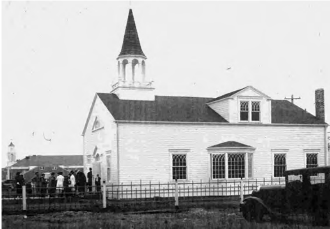
A year or two after photo above, and what a difference! Note tower of Lakewood theater in background.

the building in conformity with the colonial appearance of the buildings in the shopping center.