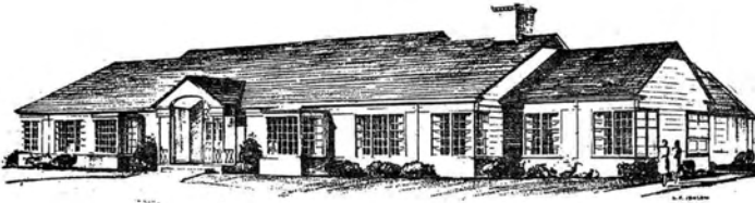
Architect's rendering of church school.

and seminars were conducted to nurture the parents of our nursery school children. A strong youth program following the "Youth Club" model, was begun, with annual mission trips for the senior high youth being a highlight. The childcare center opened in 1979, becoming one of the first to care for children less than a year old.