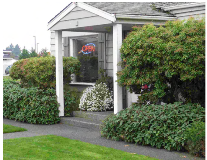
Allen Realtors' "home" office on Gravelly Lake Drive.