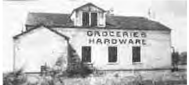
Little store on the prairie, circa 1936

he year was 1937. The place was an expanse of open prairie covered with Scotch broom and flowing quack grass. It was a small country store; a combination grocery and hardware store built in 1920 but, 17 years later, abandoned and falling in disrepair. It stood alone in the middle of several hundred acres of land that had been purchased by Norton Clapp . The main purpose for Mr. Clapp's purchase was to develop a shopping center, later named Lakewood Community Center. Even though the little store was a part of that purchase, it was not included in the original design of the center.