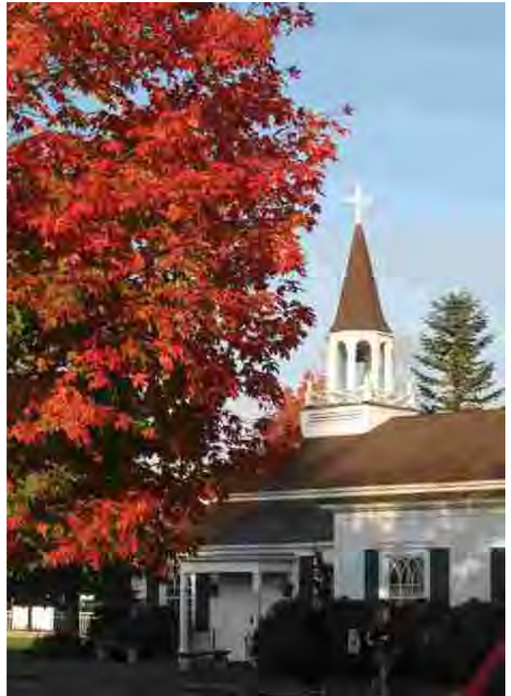
The Little Church on the Prairie, Autumn 2013

Sunday services are held at 8:45 a.m. (traditional) and 11:00 a.m. (contemporary). More information is available on the Little Church on the Prairie's web site at www.lcop.ws , or by calling the church office at 253-588-6631, or visiting the church at 6310 Motor Ave. SW in Lakewood.