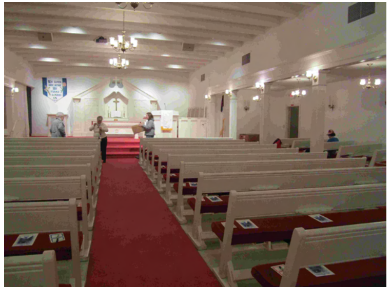
The sanctuary, 2012.

By 1966, over-crowding in the church school forced consideration of expansion to provide additional space to accommodate the increase. This ambitious expansion called for the church to add a library and reception room to the sanctuary building, enlarge Prairie Hall, build a new administration addition and remodel an existing education wing. The cost? A whopping $225,000!