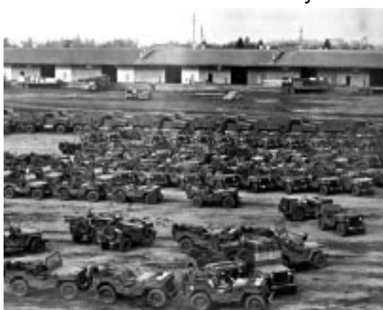
Jeeps galore. The WWII heyday of the supply depot that became CPTC.

In 1951, the federal government was phasing out the Navy Supply Depot (the current site of CPTC), and the Clover Park School District was granted approximately 130 acres (remaining acreage eventually becoming the thriving commercial development known as Lakewood Industrial Park). Although the school district occupied most of the seven concrete block buildings (which included the steam plant with underground power and heating designed to withstand aerial bombings anticipated during World War II), the school district soon moved to other locations in Lakewood.