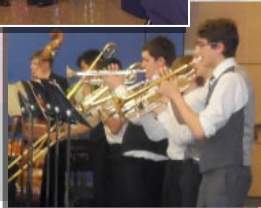
Bottom: Lakes High School Jazz Band wows the crowd with their hot tunes, played with polished professionalism.