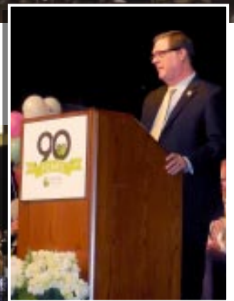
Congressman Heck addresses the audience.