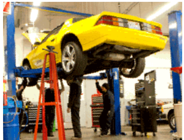
State of the art automotive shops—today (above) and in 1971 (left)

School District retained Clover Park Vocational-Technical Institute, and it was kept separate from the plans for the Clover Park Community College (which later became Ft. Steilacoom Community College, and then Pierce College).