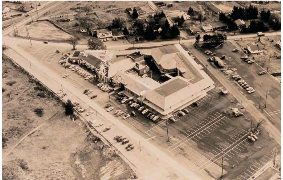
Lakewood was still more prairie than populated when this picture of the recently completed Colonial Center was taken in 1951.

Before 1937 the fledgling Lakes District community lacked convenient shopping and vital services that today's residents take for granted. Fortunately, Norton Clapp, anticipating these needs, built the Lakewood Community Center in the heart of Lakewood. By the time the first building was finished in 1951 and the East building was completed in 1955, every conceivable need was met by local businesses.