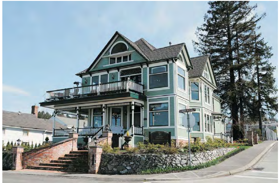
E. R. Rogers mansion: crown jewel in the Steilacoom Historic District