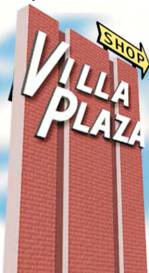
Long-time residents will have no trouble recognizing this once-familiar landmark

Also in the complex are the Lakewood Theatre and the Lakewood Terrace Restaurant (both vacant).